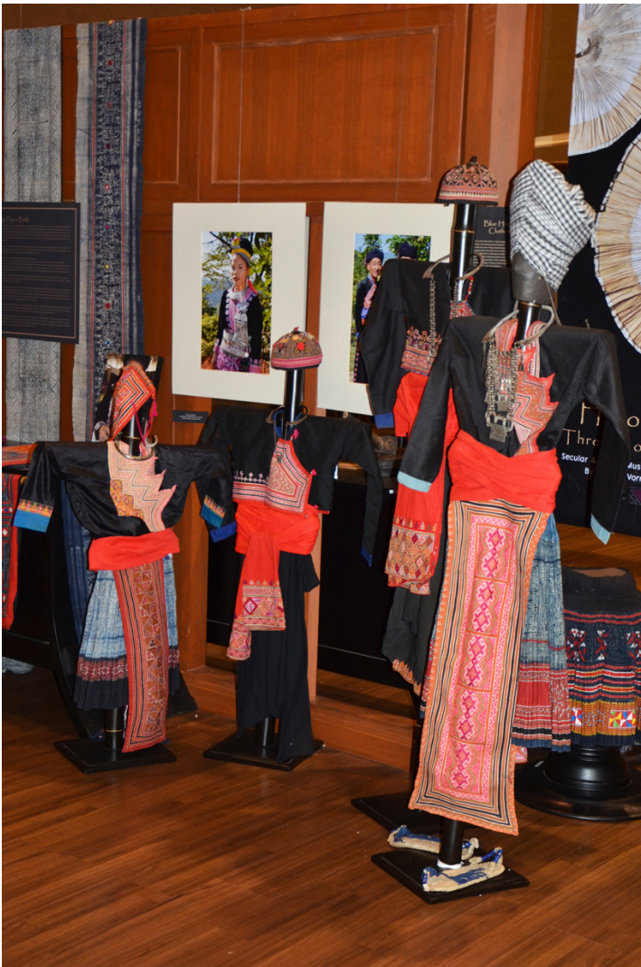
Hmoob Ntsuab (White Blue)