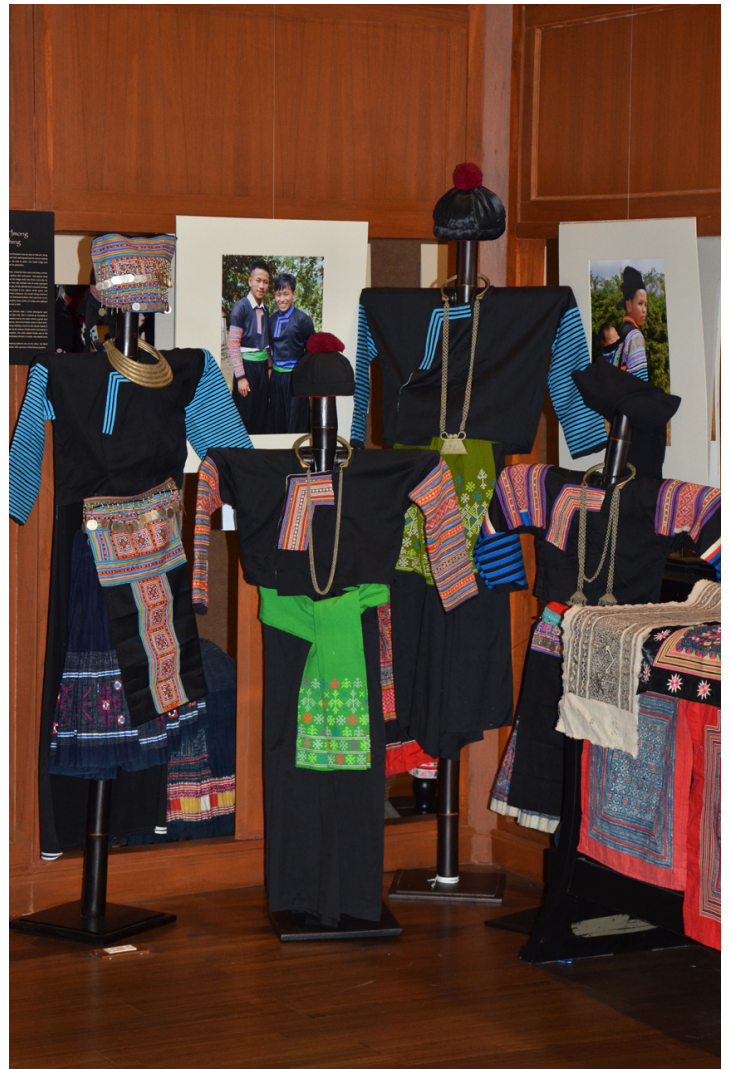
Hmoob Dub (Black Hmong)