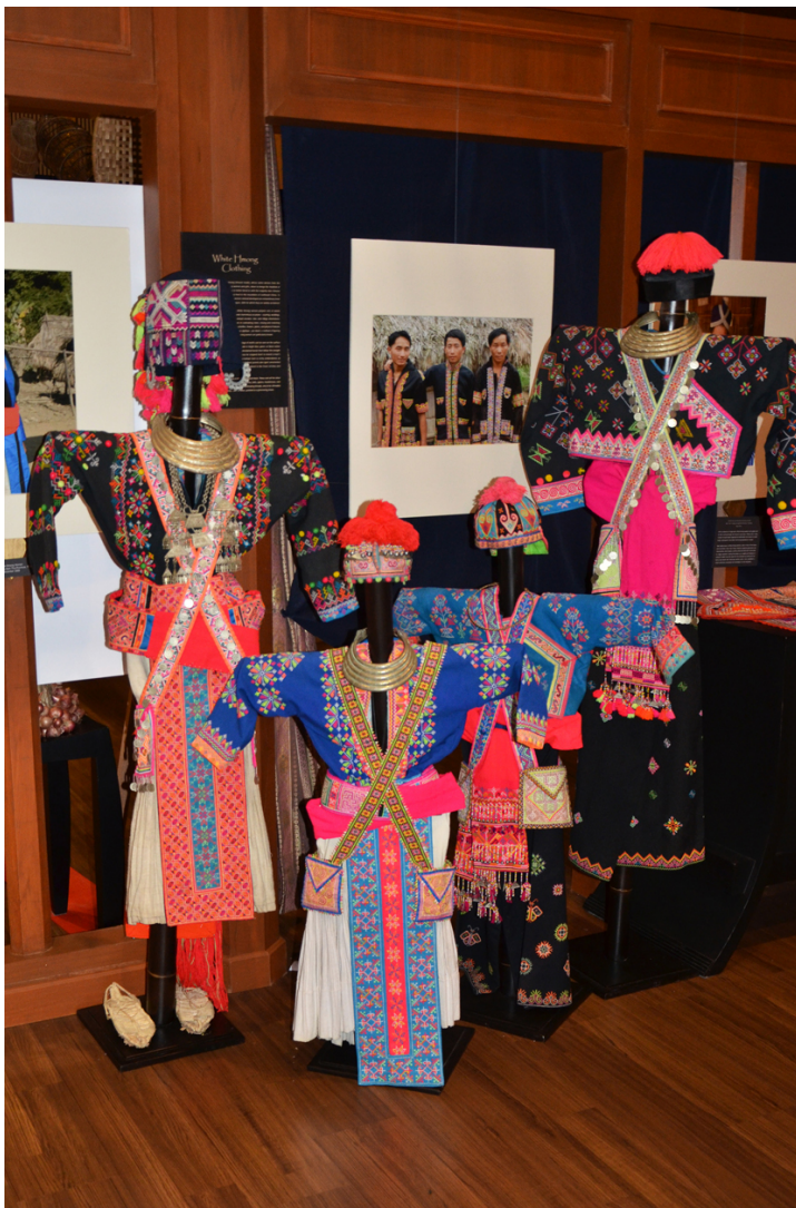
Hmoob Dawb (White Hmong)

Mannequins: Elegant custom-made bamboo supports with a wooden base (fumigated, dyed in matte teak brown, and laminated). Mannequins are constructed with removable units to facilitate the dressing process (e.g. Two arms are made of four bamboo segments that slide into one another). When dismantled, mannequins are stored in individual sturdy bags, identified by tribe and person, for easy storage and shipping.