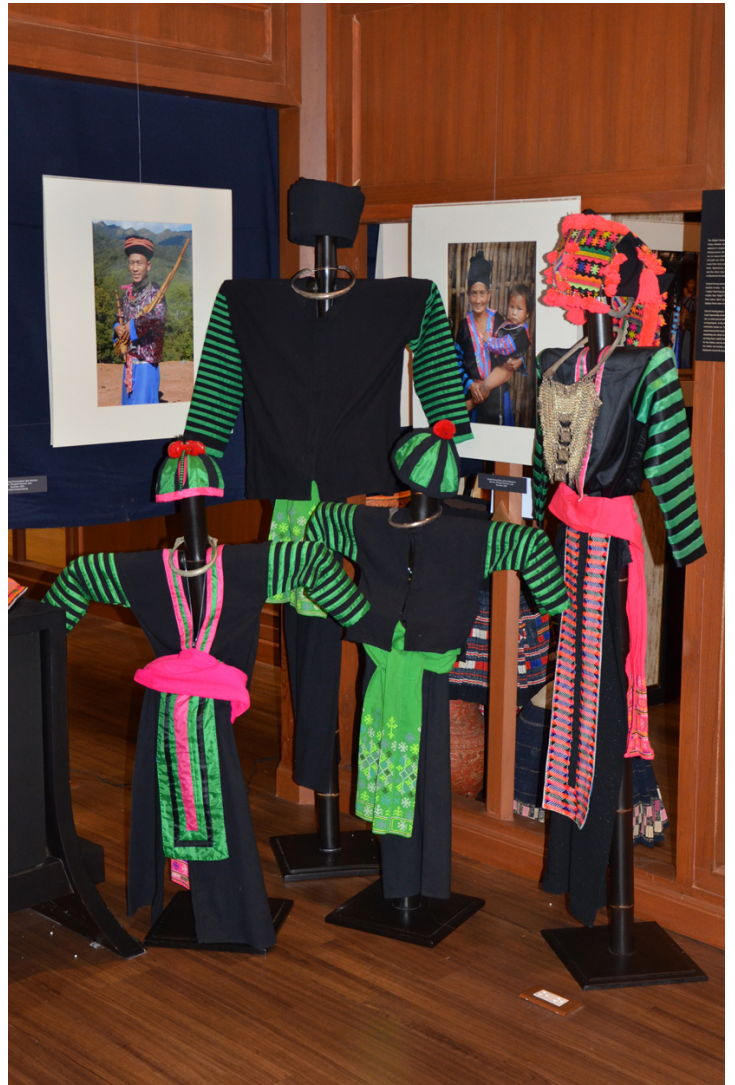
Hmoob Txaij (Striped Hmong)